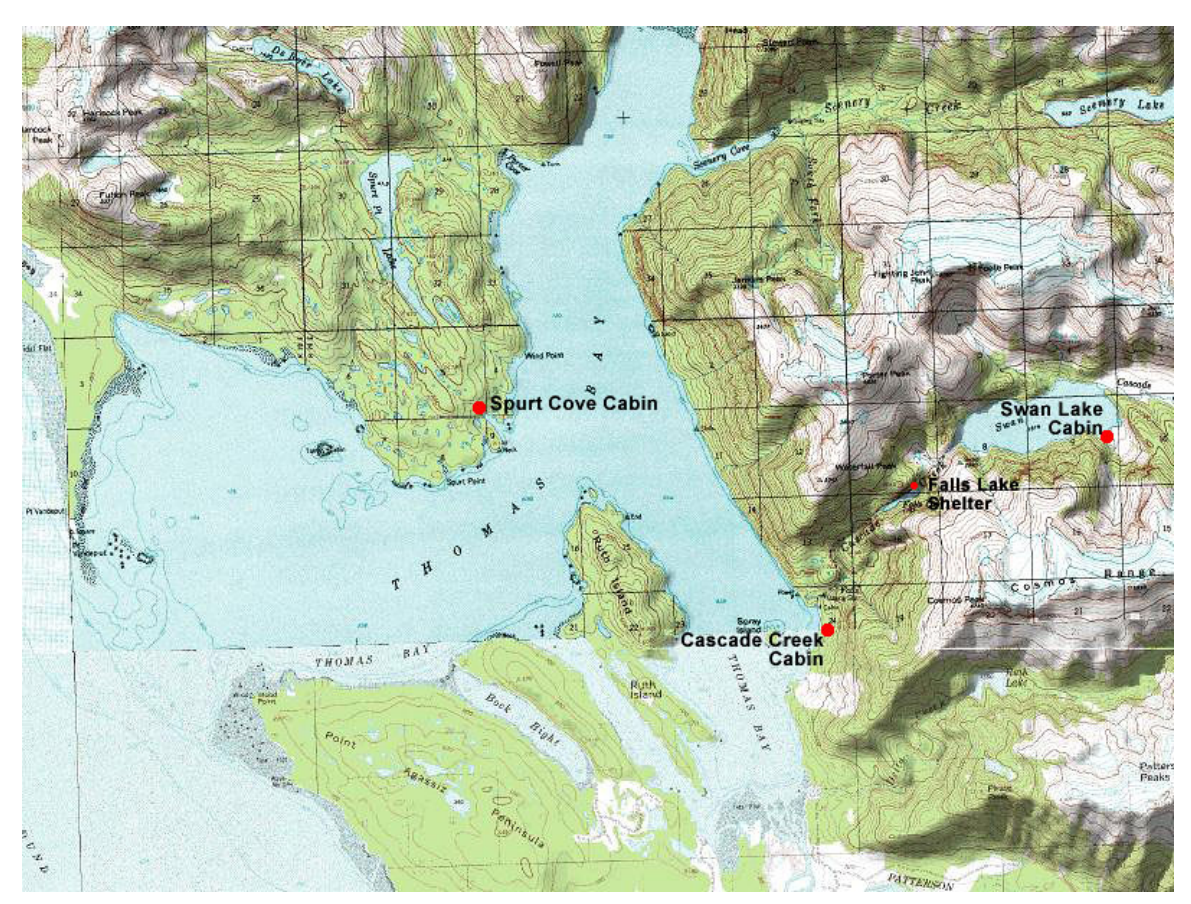
Figure 1. US Forest Service Cabins in the Study Area

CCLLC will also identify potential recreation facilities/access (such as installation of a new dock on Thomas Bay) and alternatives that the proposed Project may provide.